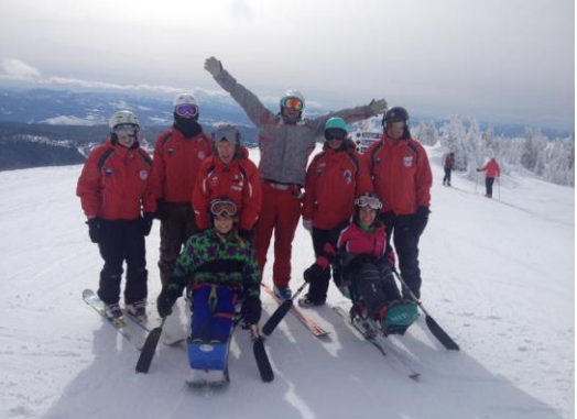
Participants in the Adaptive Sports at Sun Peaks Program with Instructors

Students in the TRU Tourism Department's Event Management 2170 class (Fundraising in Non-profits) are getting hands-on experience with fundraising for the ever-needing charitable sector in the Kamloops region.